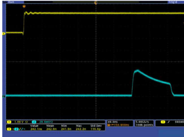
Top trace: external trigger Bottom trace: laser output pulse