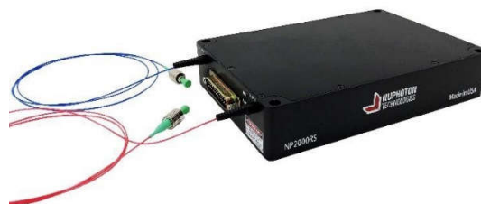
ASE source has only one optical cable