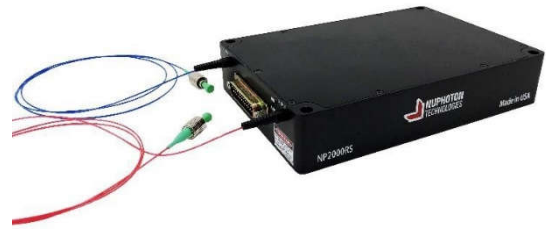
ASE source has only one optical cable