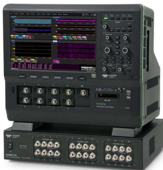
8 analog channel + 16 digital channel, 1 GHz, 12 bit resolution HDO8108 high definition oscilloscope with SAM40-24 provides 8+16+24 channel acquisition capability.