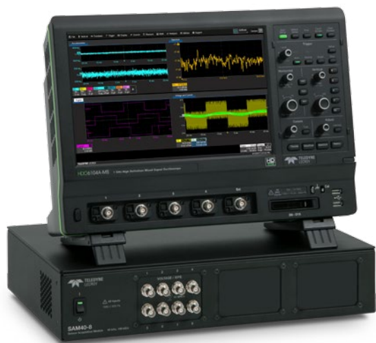
4 analog channel + 16 digital channel, 1 GHz, 12 bit resolution HDO6104A-MS high definition oscilloscope with SAM40-8 provides 4+16+8 channel acquisition capability.

Engineers commonly use multiple instruments to debug and validate complex deeply embedded control systems, mechatronics, and electro-mechanical systems. Multiple instruments report different information on different displays and in different formats. An HDO with a sensor acquisition module cost-effectively replaces multiple instruments with one consolidated view of system performance. Leverage the Teledyne LeCroy deep toolbox to perform math, measurements, pass/fail and other analysis on all acquired data, or apply an application package to gain even faster time to insight.