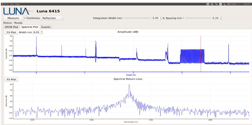
Measuring in reflection mode, the Luna 6415 measures return loss versus length. The bottom plot shows the spectral content of the identified reflection event (grating).

High-Speed and High-Resolution OFDR Measurements for Manufacturing Test